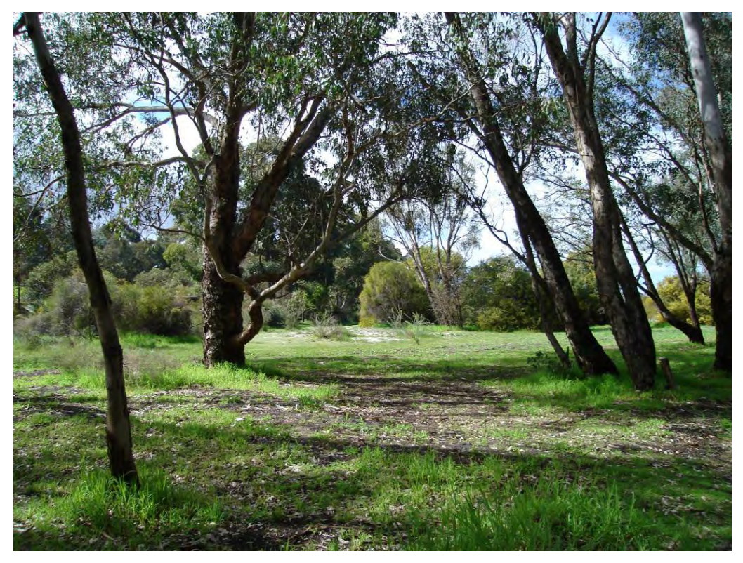
Plate 5: Southern Portion of Conservation Category Wetland – looking east (Photo 10)

Guidance Statement No. 3 states that buffers to wetlands depend on a number of factors, including: