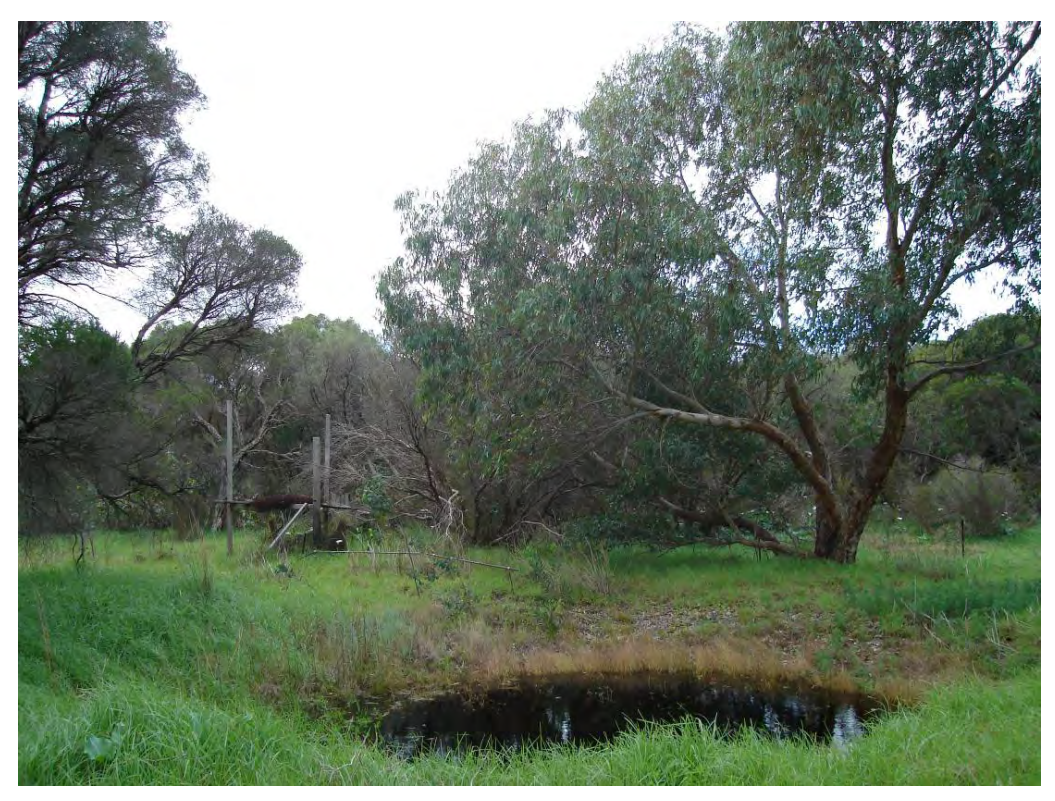
Plate I: Northern Portion of Conservation Category Wetland – looking east (Photo 6)