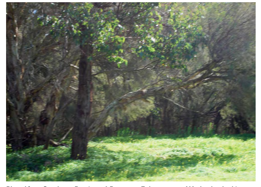
Plate 10: Southern Portion of Resource Enhancement Wetland – looking north (Photo 5)