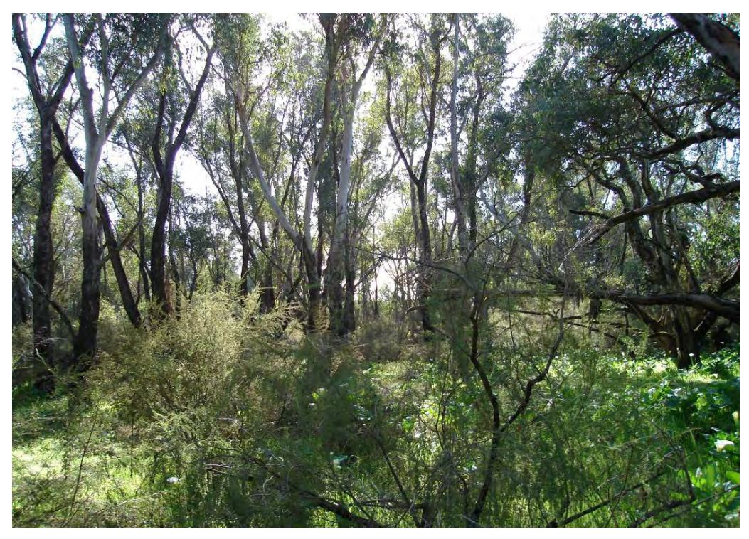
Plate 7: Central Portion of Resource Enhancement Wetland – looking north (Photo 2)