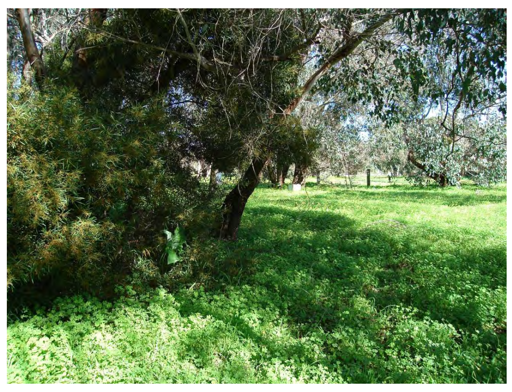
Plate 9: South-eastern Portion of Resource Enhancement Wetland – looking west (Photo 4)