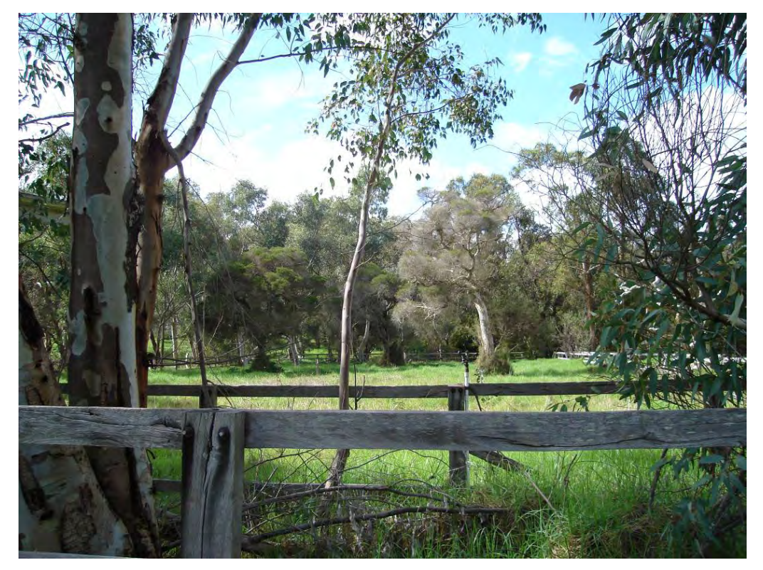
Plate 2: Central Northern Portion of Conservation Category Wetland – looking east (Photo 7)