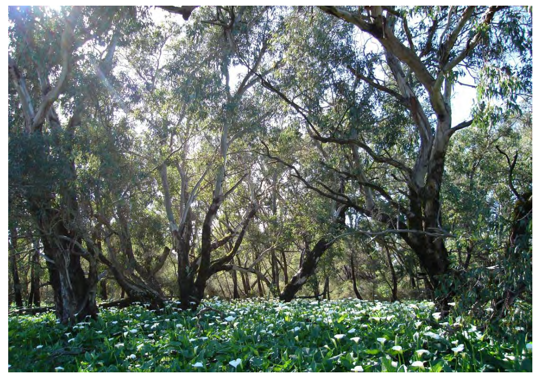
Plate 6: Northern Portion of Resource Enhancement Wetland – looking northeast (Photo I)