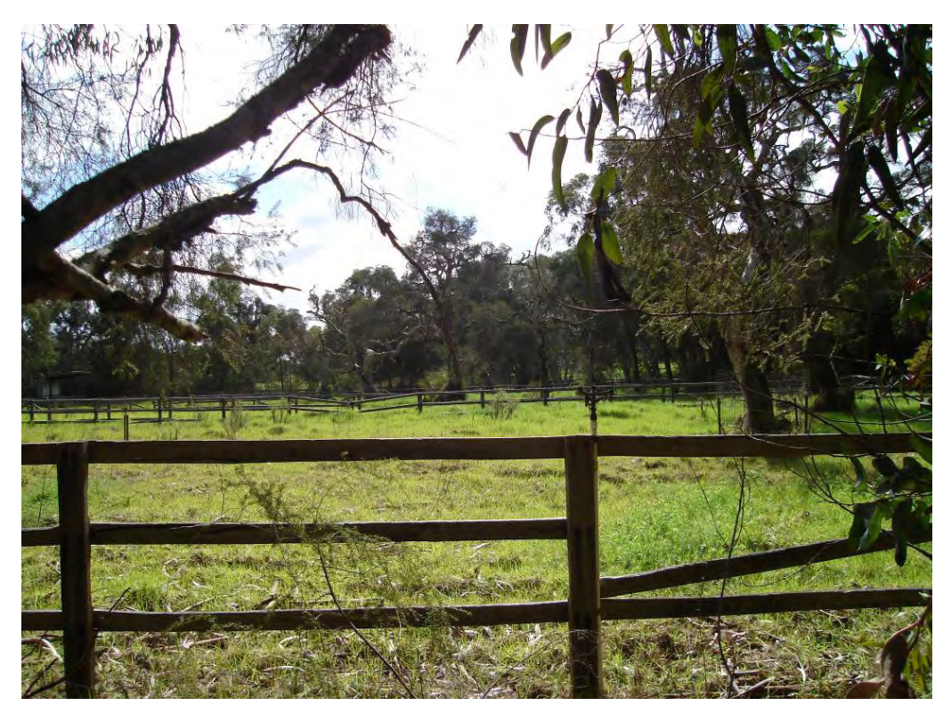
Plate 3: Central Portion of Conservation Category Wetland – looking north (Photo 8)