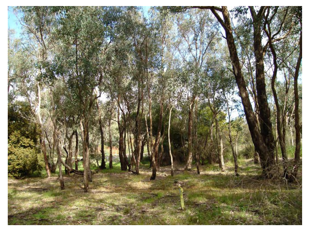
Plate 4: Southern Portion of Conservation Category Wetland – looking southwest (Photo 9)