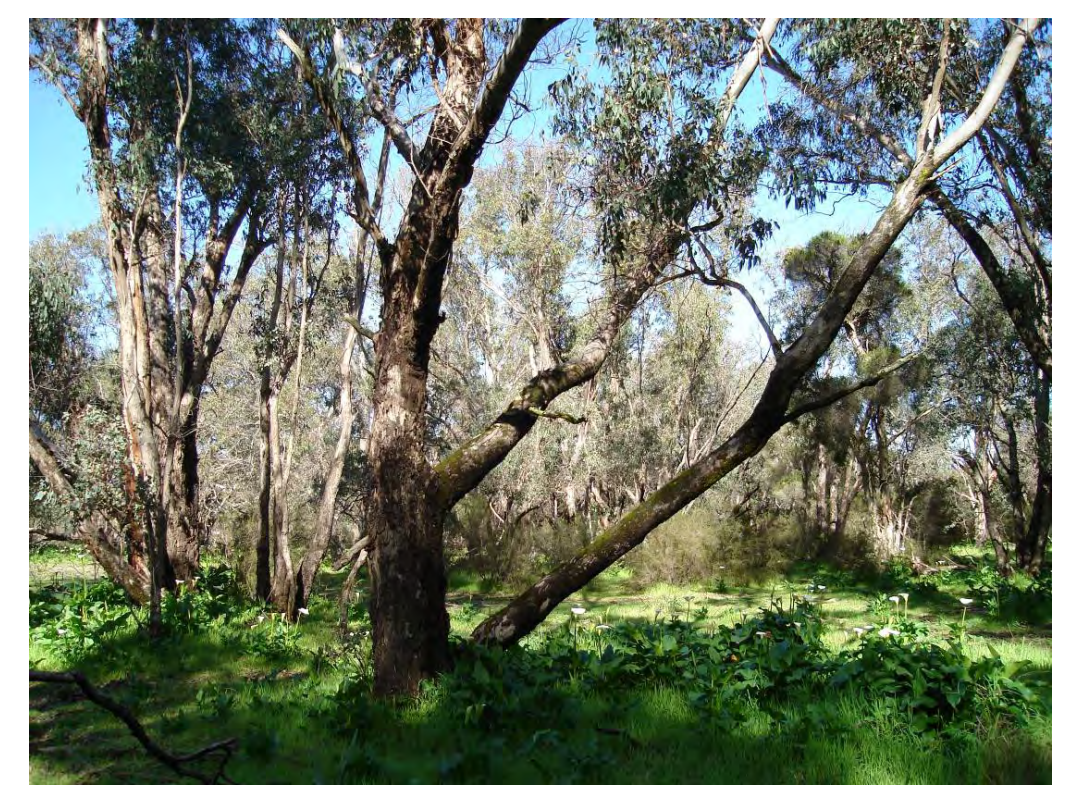
Plate 8: Central Portion of Resource Enhancement Wetland – looking south (Photo 3)